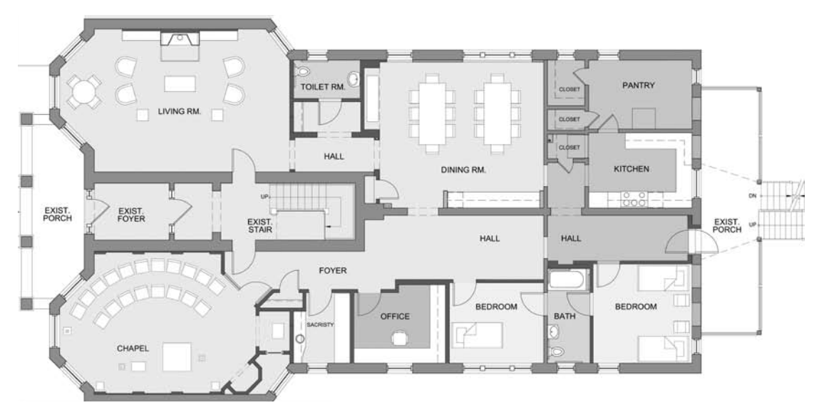
A U-shaped seating design in the living room lets community members face each other for easy conversation. The focal point could be artwork that celebrates the community's history or charism.

Constructing a new building may be a more likely option in a suburban or rural location where site costs are less expensive. The idea of starting with new construction is positive in terms of designing the ideal floor plan that is unencumbered by existing walls and living in a new, low maintenance building. However, in large urban areas like Chicago, commuting from a distant suburb to minister in the central city would be impractical. In addition there is the negative environmental impact of adding to suburban sprawl.